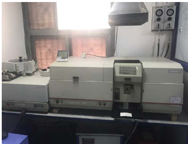
ATOMIC ABSORPTION SPECTROPHOTOMETER (AAS)