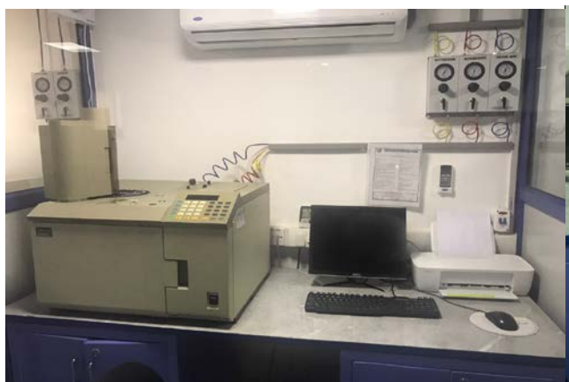
GAS LIQUID CHROMATOGRAPH (GLC)