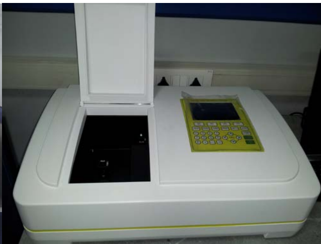
ULTRA VIOLET / VISIBLE SPECTROPHOTOMETER