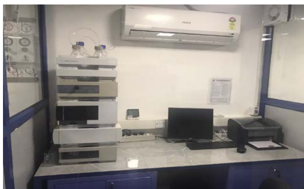
HIGH PRESSURE LIQUID CHROMATOGRAPH (HPLC)